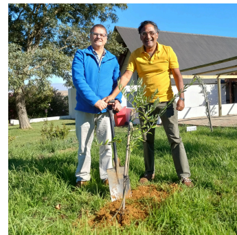
Planting two olive trees