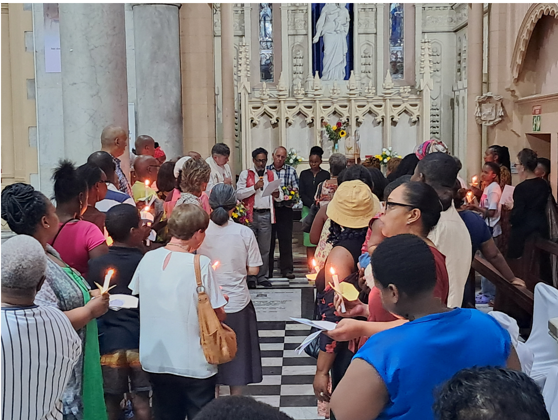
Mass goes gather with candles around the shrine of Archbishop Hurley to recite the prayer endorsed by Cardinal Napier.