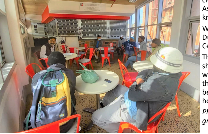
Photo: Homeless men and women at one of the Synod discussion groups in the Denis Hurley Centre café.

The group was very taken by the words of the Pope: "The Church should be the place that welcomes everyone and refuses no-one." But when asked to grade churches on how well they lived up to that vision the results were very mixed. One homeless man used words that we believe Francis would like: "The work of the Church is to give people hope." That vision should give all people of faith pause to reflect.