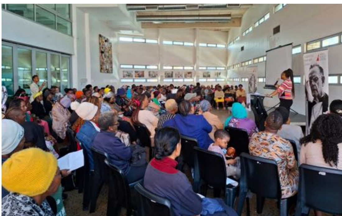
Photo: The Gandhi-Luthuli Peace hall at the DHC was full of women from all walks of life engaging on some relevant and challenging topics.

This conference reminded us that real change starts with listening. When women feel safe to speak, and others are ready to hear, healing and hope can grow. We at the DHC are honoured to walk this journey alongside them.