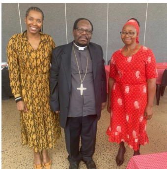
Archbishop speaks out strongly