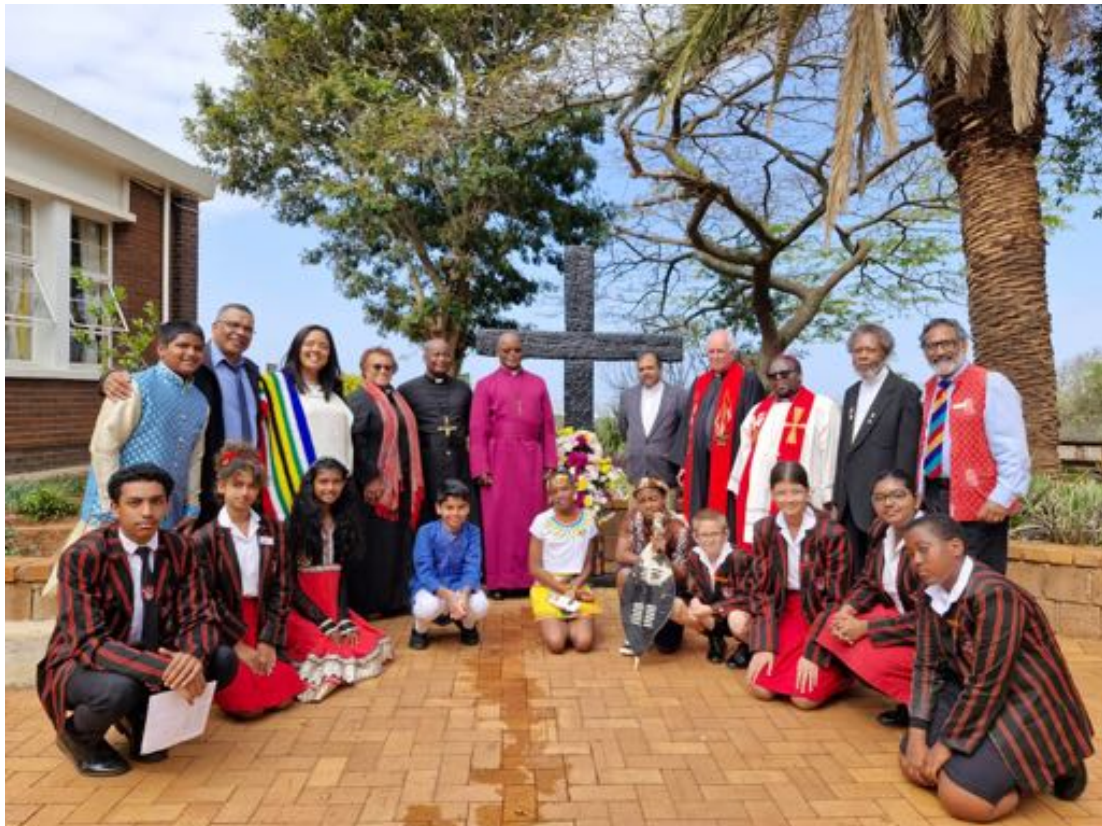
Photo: Christian leaders and school children gathered around the flowered cross lent by Diakonia Council of Churches. See our Facebook page for more photos.