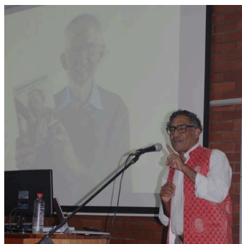
Telling the story of Paddy