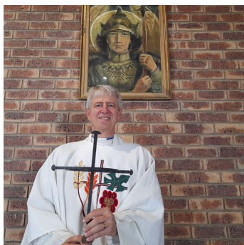
Connecting two St Michael's